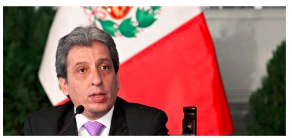
Peru environment minister Manuel Pulgar-Vidal says he wants 'Lima summit to leave a green legacy.'

"If what we want by Paris 2015 is a new binding global climactic agreement, then what we need to produce in Lima is a solid working draft." said Pulgar-Vidal.